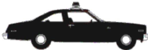
2-Door Coupe 111" Wheelbase Nova 1XX27

The Chevy Nova is an American compact designed for demanding severe-duty police work. It offers the savings in operating costs you would expect from a compact plus comfortable head room and leg room for driver and co-driver. And Nova is proving itself in the field, too. It is being utilized in volume across the country including the St. Louis Police Department (189 units), the Los Angeles Sheriff's Department (75 units), and Madison, Wisconsin, Police Department (32 units), to name just a few.