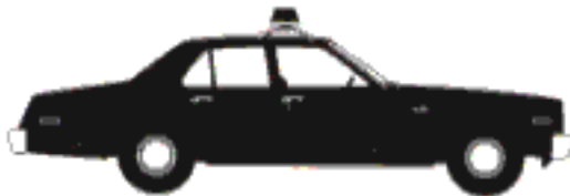
4-Door Sedan 111" Wheelbase Nova 1XX69